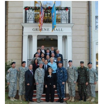
(left) WHINSEC Cmdt briefs the board; (rt) BoV attendees at the WHINSEC campus.

Overall assessment was that the Institute is fulfilling its legal obligations and accomplishing its assigned missions.